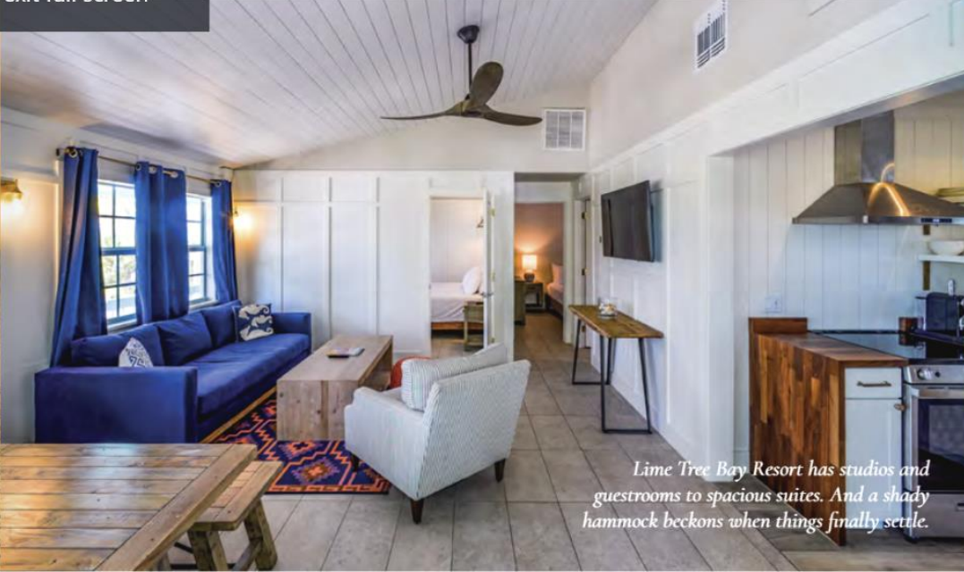
Lime Tree Bay Resort has studios and guestrooms to spacious suites. And a shady hammock beckons when things finally settle.