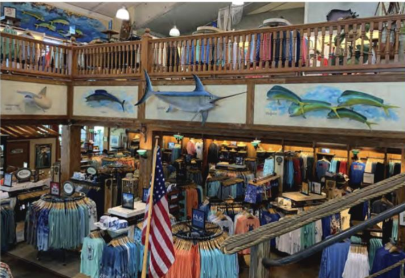
This World Wide Sportsman – Bass Pro Shops location embodies all that is the Keys. In addition to fishing equipment, this gigantic store stocks gear for boating, hunting, camping and all things outdoors.

DOWN THE ROAD FROM THE LIME TREE BAY RESORT IS THE FAMOUS WORLD WIDE SPORTSMAN LOCATION THAT FEATURES BASS PRO SHOPS AND THE ISLAMORADA FISH COMPANY RESTAURANT.